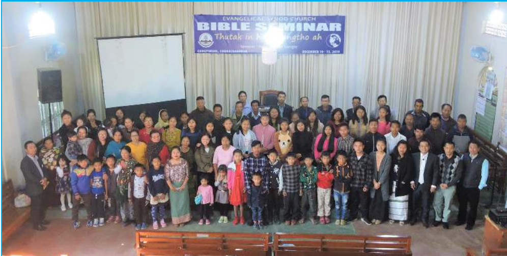
GANGPIMUOL BIBLE SEMINAR DECEMBER 10-15,2019